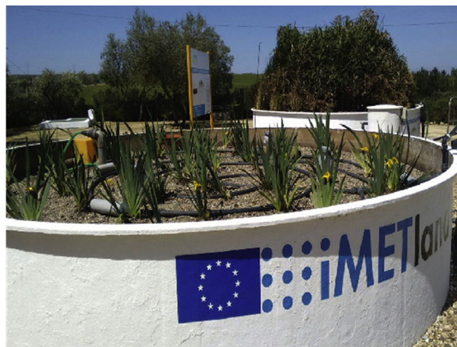
Fig. 3. METland® unit (20m 2 ) for treating wastewater from 50pe at Carrion de los Céspedes wastewater treatment plant (Spain).

Constructed wetlands are now well established for wastewater treatment. The so-called METland® (Fig. 3) is a MET-based application that integrates the use of electro-conductive granular material in constructed wetlands to effectively perform bioremediation in diverse contexts. Originally, METland® was designed to operate under flooded conditions and short-circuit modes as “snorkel” electrodes [67]. The natural redox gradient between the bottom of the system and the naturally oxygenated surface greatly enhanced microbial oxidative metabolism for removing organic pollutants [67]. The electron flow along the METland® bed was elegantly demonstrated by measuring the profile of electric potential along distances larger than 40 cm [68,69]. Full scale METland® units have been constructed with different electroconductive granular material like electroconductive coke [67] or more sustainable materials like electroconductive biochar (ec-biochar) obtained after wood pyrolysis at high temperature [70]. Although most of the MET-based applications are classically operated under anoxic conditions to avoid oxygen competition with anodic reactions, METland® has been recently proved to be effective even under down-flow aerated mode [71]. Electroactive bacteria from the genus Geobacter have been found to